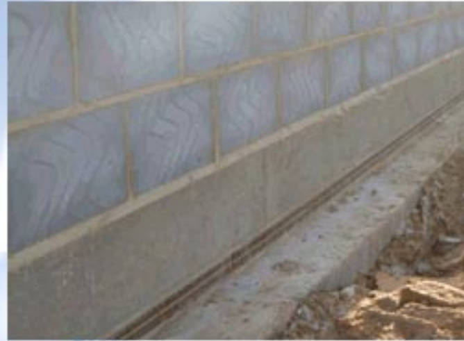
Load bearing masonry strip, 11Hz