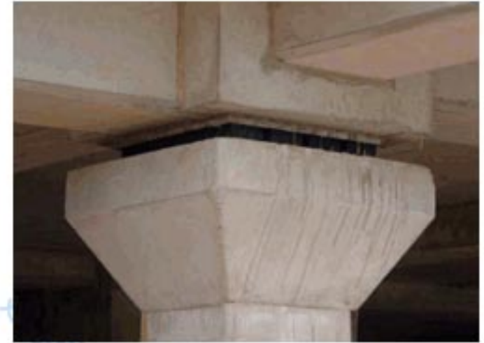
Reinforced concrete frame isolation bearings, 10Hz